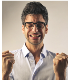
YOU, the member!