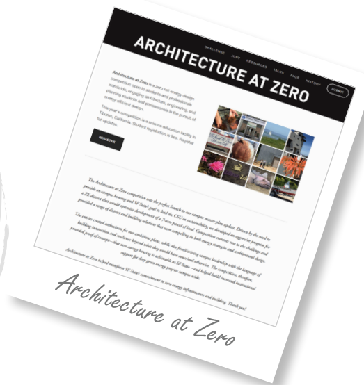
Architecture at Zero

Relevance: Weekly e-newsletter to members, open rate 29%